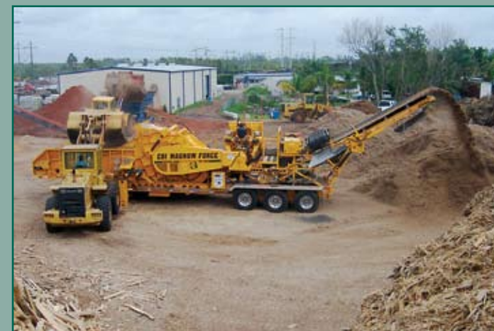
Regrind of Mulch (shows optional overband magnet)