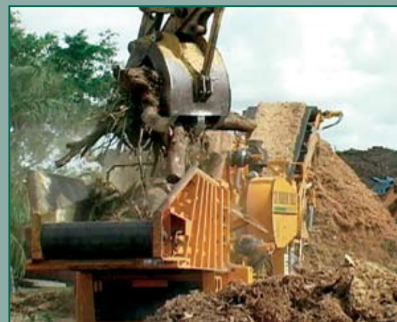
Stumps and Logs